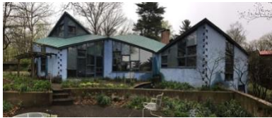
Esherick's 1956 Workshop co-designed with Louis Kahn.