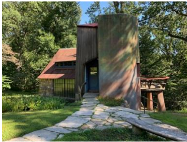
Wharton Esherick's Studio