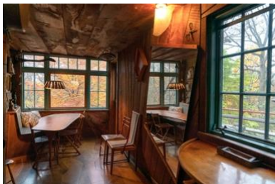
Esherick Studio dining room