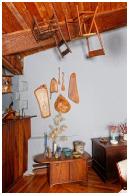
Esherick's work on display in the 1956 Workshop.