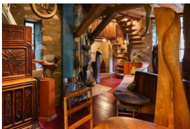
Wharton Esherick's Studio