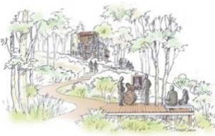
Sketch of the proposed "Ramble" path connecting the upper and lower campus.