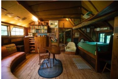
Esherick's bedroom.